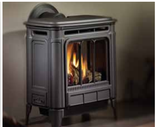
\ensuremath{\mathsf{H27}} in charcoal gray finish with decorative glass grill