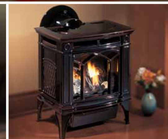
H15 in enamel timberline brown finish with decorative glass grill