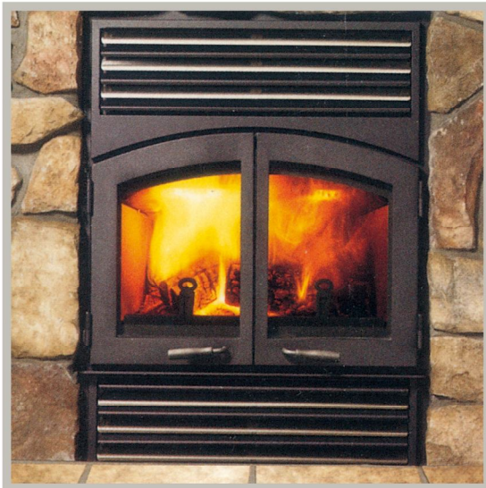
R90 featuring black with steel louvers.