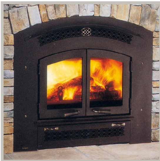
EX90 shown with Excalibur front in black.