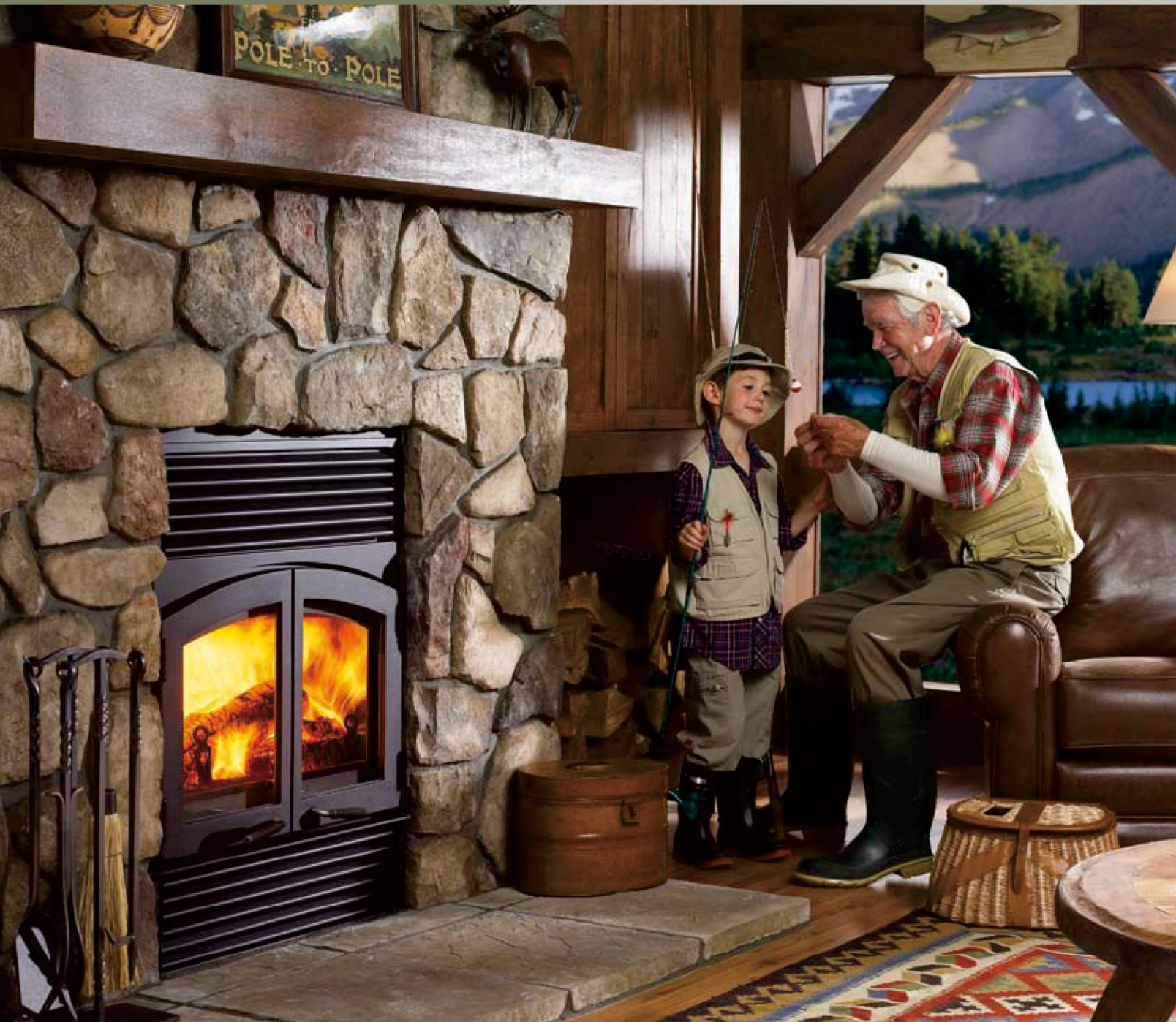
R90 featuring black louvers.

Regency's high efficiency fireplaces put a designer face on a hard working heater. Just load up your Regency and tuck in for a cozy night's sleep. Delivering up to 70,000 BTU of high efficiency heat, your Regency will burn for up to 8 hours while your rest. Choose a traditional design (R90) or an arched Excalibur front (EX90) with tasteful accessory options to create the perfect furnace with a view!