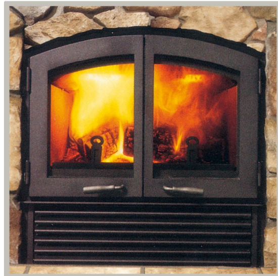
R90 featuring louvers and gravity air kit.